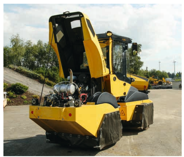
The hinged engine hood can be opened wide allowing fast, unobstructed access to the engine.

A powerful working machine has to be able to do one thing above all: roll, roll and roll again. Downtime needs to be kept to an absolute minimum. With its easy maintenance, the BW 11 RH-5 meets this requirement perfectly.