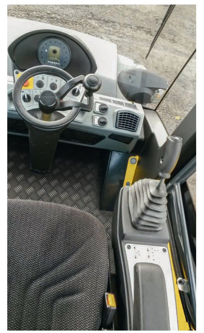
All important operating controls can easily be reached and selected. Every move is just right.

The state-of-the-art hydrostatic drive of the BW 11 RH-5 is in a class of its own. Whether driving fast or slow, on steep inclines or for high surface coverage: three speeds allow the right choice for any application.