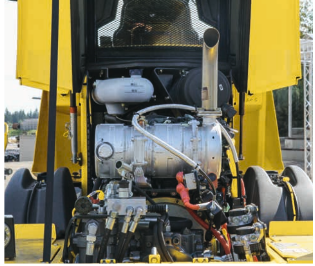
All engine service points are easy to access. So maintenance work can be performed quickly and easily.

The radiator is in an excellent vertical position right behind the cab. This means it stays clean and doesn't need extra cleaning. Maintenance-free SAHR brakes also increase the ease of service on this model.