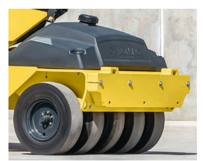
To increase stability, the ballast compartments have been positioned extremely low, as shown here above the front axle.

Precisely balanced weight distribution directly affects a range of roller characteristics. Handling, acceleration, traction and the service life of components also play a role. The result is perfect driving characteristics. And superior surface quality and compaction.