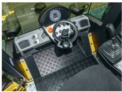
The room in the highly spacious cab is in a class of its own. For ideal work conditions.

Roller operation is intuitive and fast. The self-explanatory functions make the roller easy to handle. The driver has all the indicators and operating controls in reach and in sight. That means faster operations and even better ease of operation.