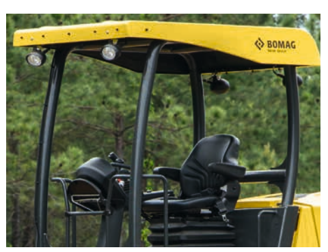
If no heating or air conditioning is required, the BW 11 RH-5 can also be delivered with ROPS/FOPS.