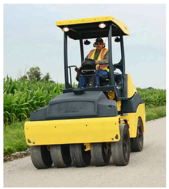
The BW 11 RH-5 provides perfect compaction and a smooth and even surface finish.

For chip sealing, an asphalt binder is sprayed onto the road and covered with a single-size aggregate chip layer. The roller takes care of the sealing. The new surface is then rolled to bed the aggregate chippings. Excess chips are removed after a curing period of 24 hours.