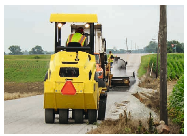
The top speed of 20 km/h offers excellent surface coverage.